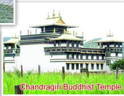
Chandragiri Buddhist Temple