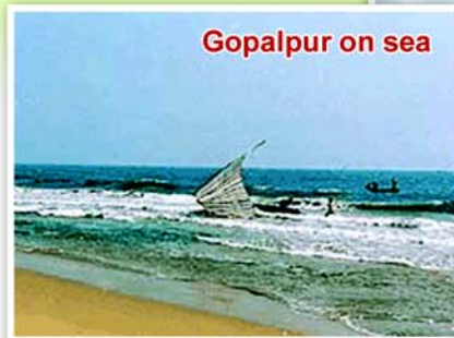
Gopalpur on sea

Those who are coming from abroad can take a flight to Bhubaneswar which is connected to Delhi, Mumbai and Kolkata by daily flights of Air India, King Fisher, Indigo, Jet Airlines etc. On reaching Bhubaneswar, Volunteers of IWFM-2011 at the airport will guide and arrange transport to Berhampur and Gopalpur on sea (places of accommodation) by road. The travel from Bhubaneswar Airport to Gopalpur on sea will take approximately three and half hours. Those who are traveling by train may note that Berhampur is well connected with most of the major cities of India. Transport will be arranged from Brahmapur railway station to respective places of accommodation during the workshop.